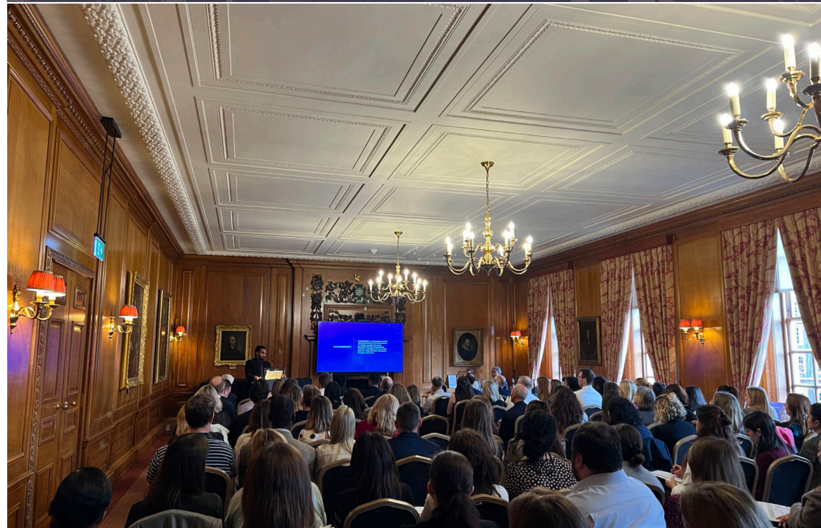
12KBW Clinical Negligence Seminar | October 2025