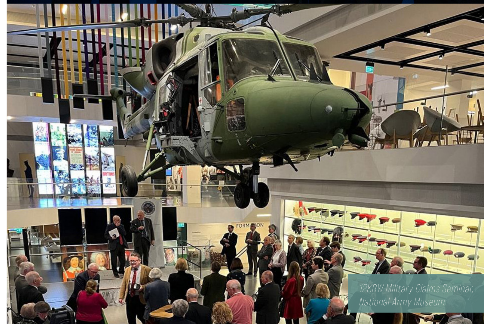
12KBW Military Claims Seminar, National Army Museum